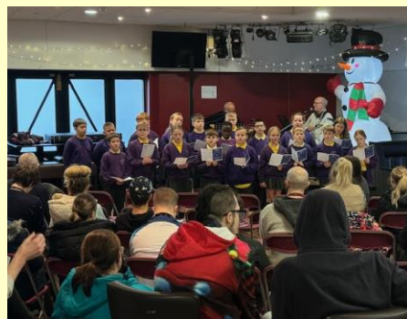
Y5/6 at Myerscough College