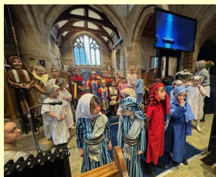
Infant nativity on Sunday